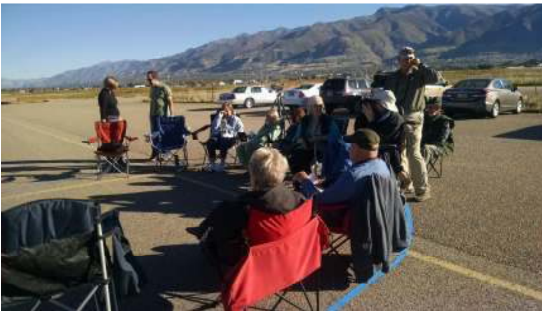
Participants in the Big Sit! Oct 10, 2015

It's not too late to give a donation in honor of The Big Sit efforts. You can send a check to Wasatch Audubon Society. Our address is in this newsletter. Thank you to all who planned and participated in this event!