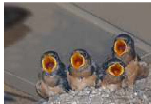
Barn Swallow Chicks

Hope to see you at our next meeting or field trip.