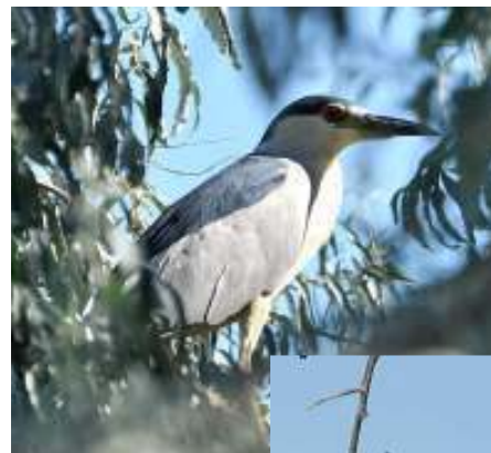
Black Crowned Night Heron